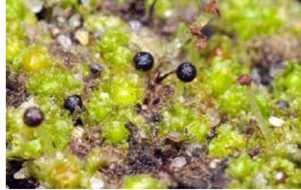
◁ Fossombronia foveolata, Buxton Heath, and its spores.