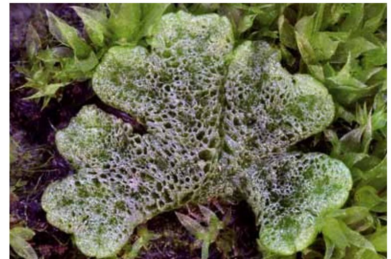
▷ Riccia cavernosa, west Gloucestershire.